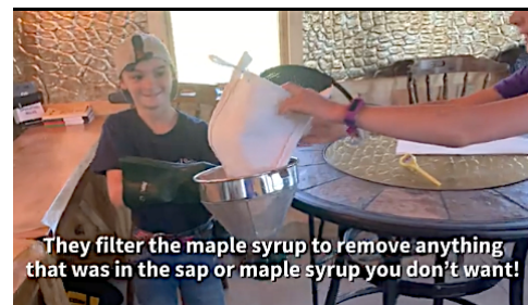
They filter the maple syrup to remove anything that was in the sap or maple syrup you don't want!